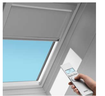
Blackout blind blocks the light