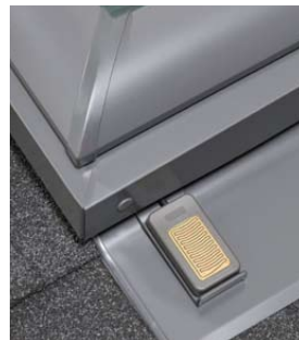
Externally mounted rain-sensor.

Venting electric skylights comes with 20 feet of standard wire.