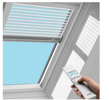
Venetian blind style and comfort