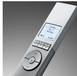
Self programming RF remote with advanced control options.