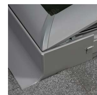
Corner key design closes perceived water hazard.