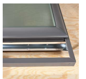
No cladding screws and only one piece to remove during installation for less time and greater simplicity while installing the skylight on the roof.